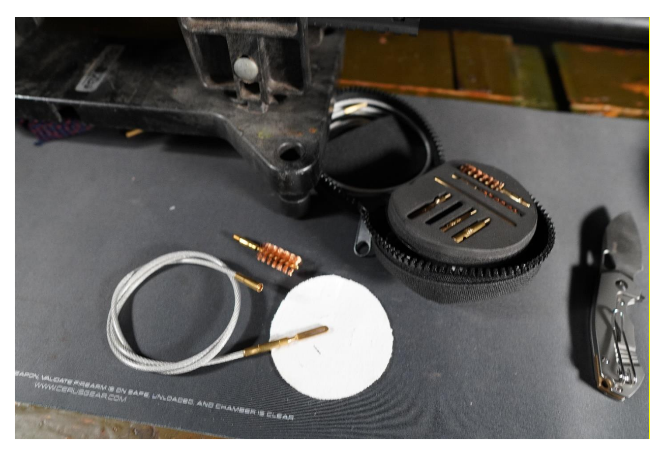
Some pull-through kits, like the Otis, use brushes and patches like conventional cleaning kits.

Attach the needed cleaning implement, push the other end through the bore, grasp, and pull through. Again, be sure to pull the cable or rope straight through the bore to minimize contact with the muzzle.