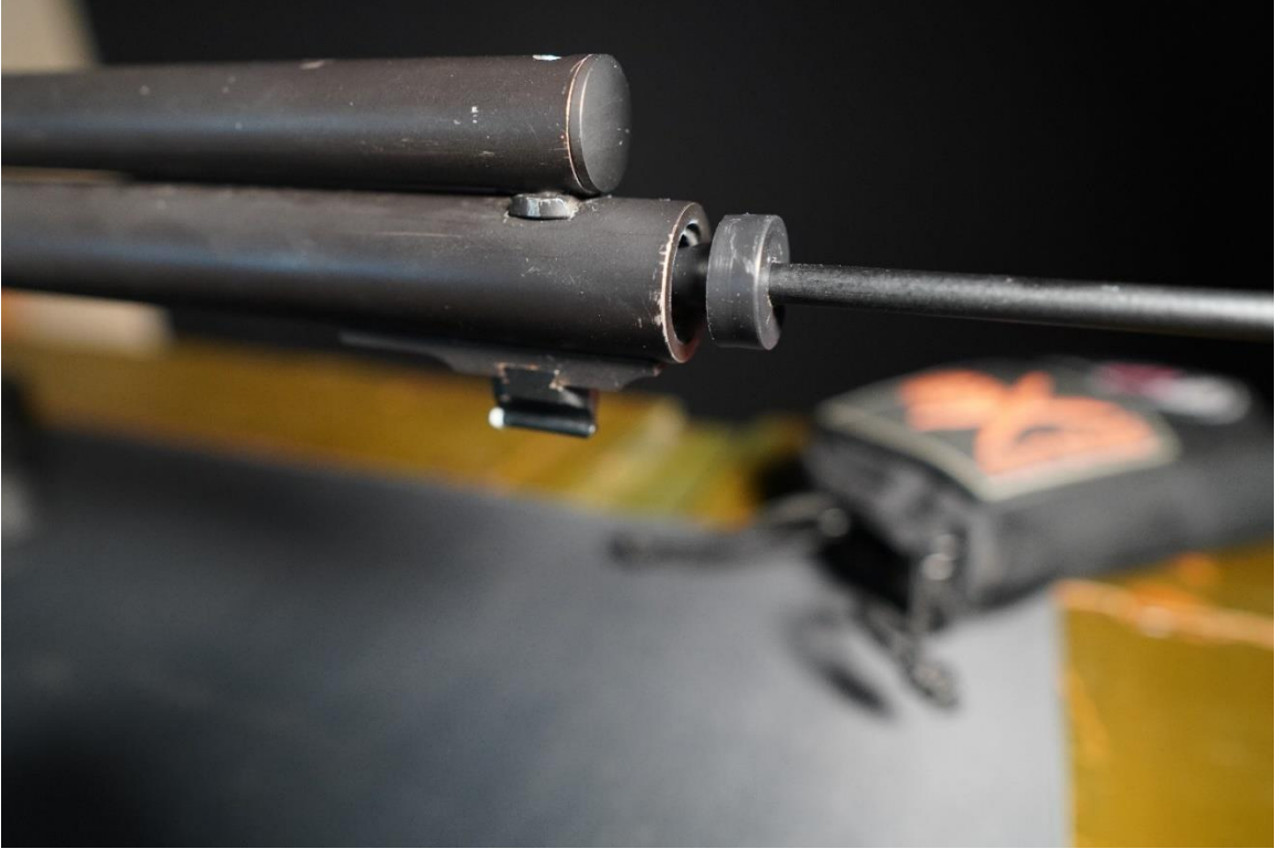
Carefully insert the cleaning implement and rod into the muzzle, careful to not contact the rifling, until the muzzle guard can be seated against the crown.