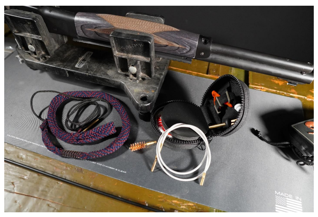
A "pull-through cleaning system," like the Hoppes Bore Snake or Otis cleaning kit, are two styles of systems that let you clean from the breach-to-muzzle.

Fortunately, there are several products that making cleaning from the breach end a breeze without disassembling the rifle. Using either a Bore Snake or some sort of pull-through cleaning kit like the ones made by Otis, it is simple to clean the barrel while protecting the muzzle.