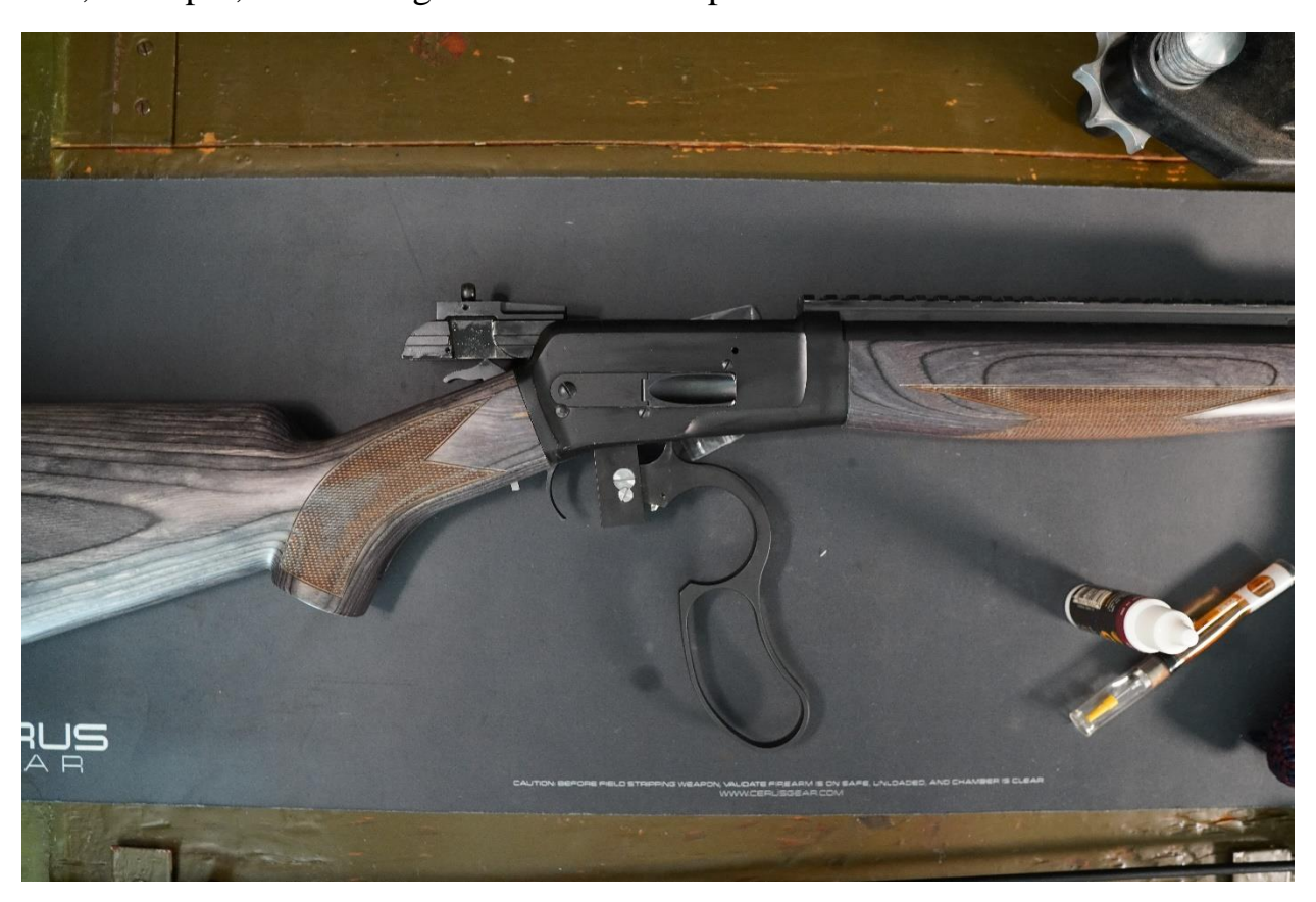
With the action open all critical parts can be cleaned and lubricated.

Big Horn Armory lever actions are rugged and only require simple maintenance to keep them running at their peak performance. Open the action all the way. The bolt, lever pin, and locking bolt are the main points of care and lubrication.