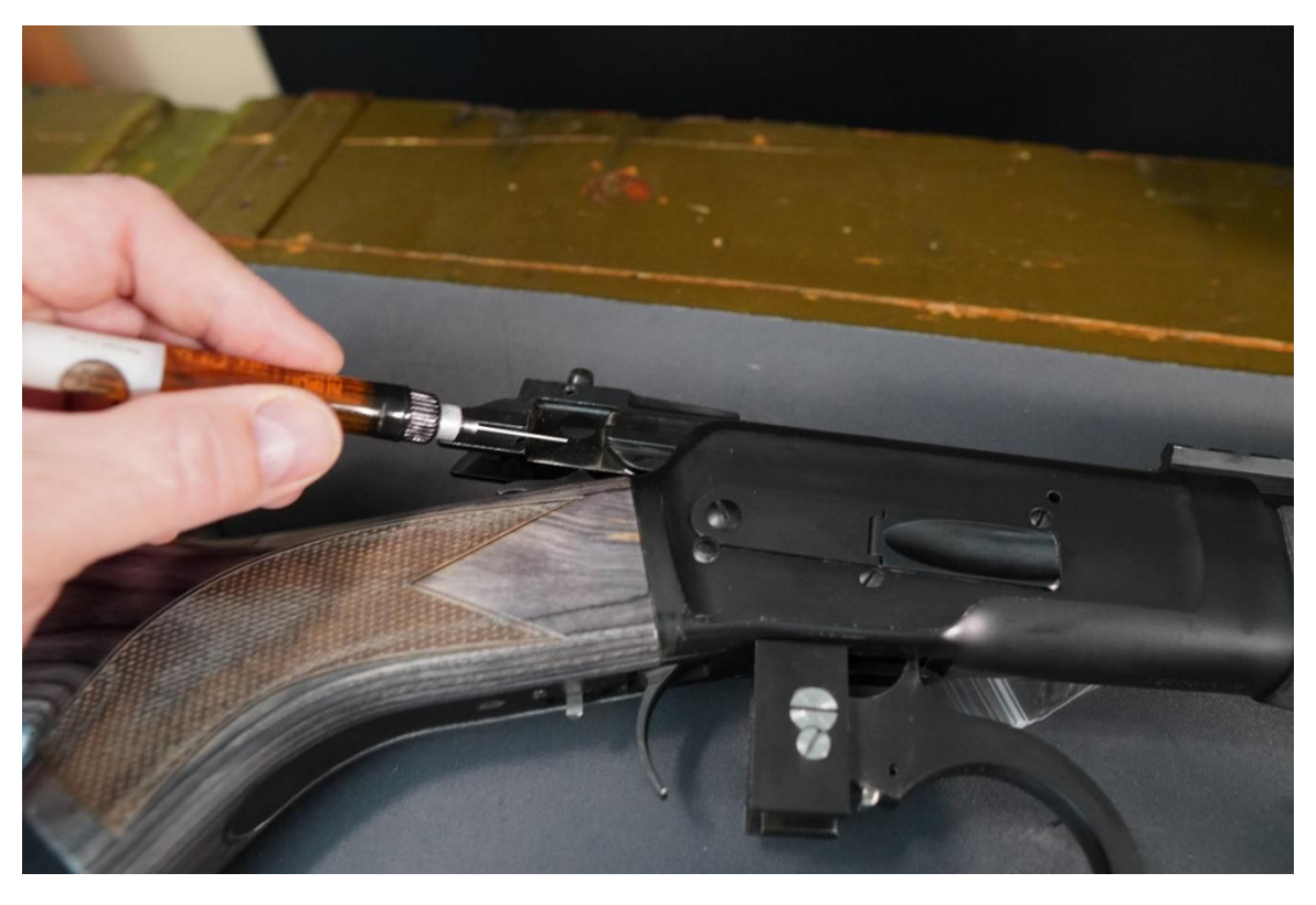
Apply a light coat of firearms lubricant to the moving parts of the action.