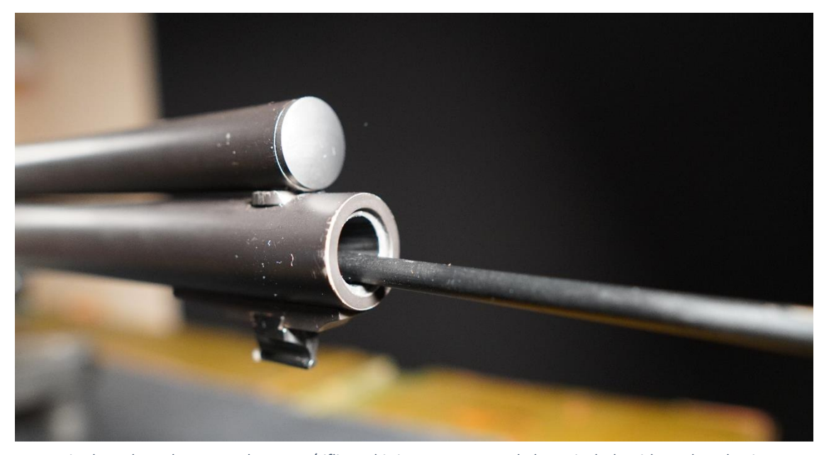
Notice how the rod contacts the crown/rifling. This is not recommended, particularly with steel or aluminum cleaning rods.

Pertaining to lever actions, there's an elephant in the room. It's more difficult to access the breach than it is for ARs or bolt action rifles. Cleaning from the muzzle is generally not recommended because repeated use of a cleaning rod from the muzzle can wear or damage the crown which hurts accuracy.