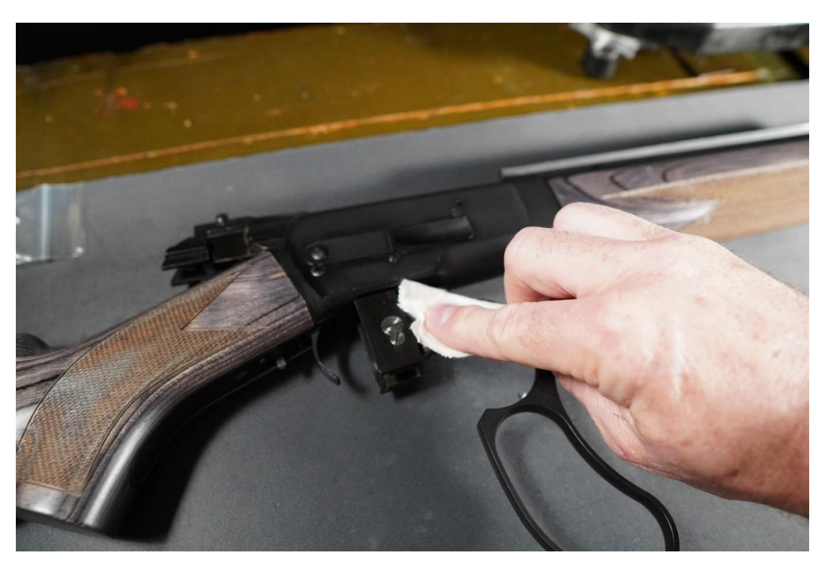
Clean or wipe off the actions moving parts.