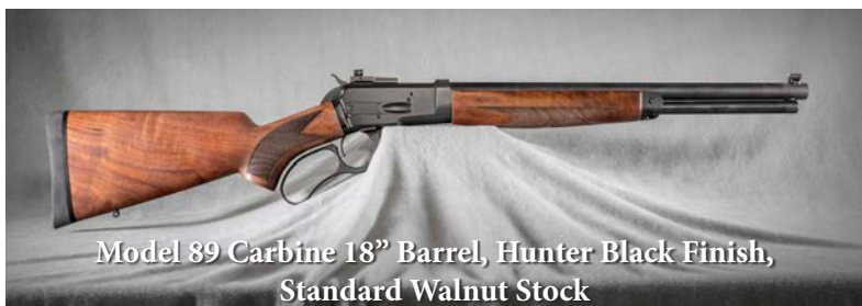
Model 89 Carbine 18" Barrel, Hunter Black Finish, Standard Walnut Stock

Combining the long tradition of great American sporting rifles with the tactical look and feel, the SpikeDriver™ provides hunters and shooters with pride in owning the best American made lever gun available and a powerful advantage afield.