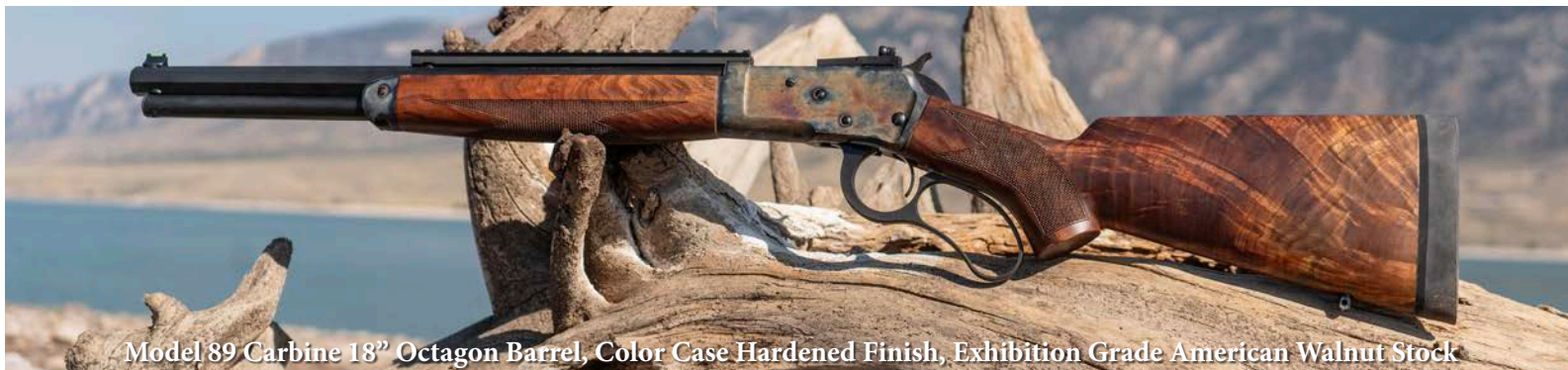
Model 89 Carbine 18" Octagon Barrel, Color Case Hardened Finish, Exhibition Grade American Walnut Stock