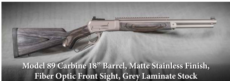
Model 89 Carbine 18" Barrel, Matte Stainless Finish, Fiber Optic Front Sight, Grey Laminate Stock