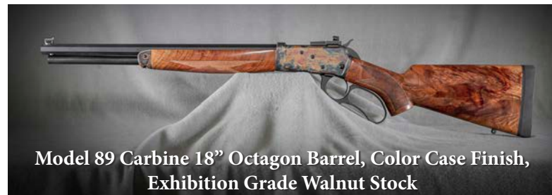
Model 89 Carbine 18" Octagon Barrel, Color Case Finish, Exhibition Grade Walnut Stock