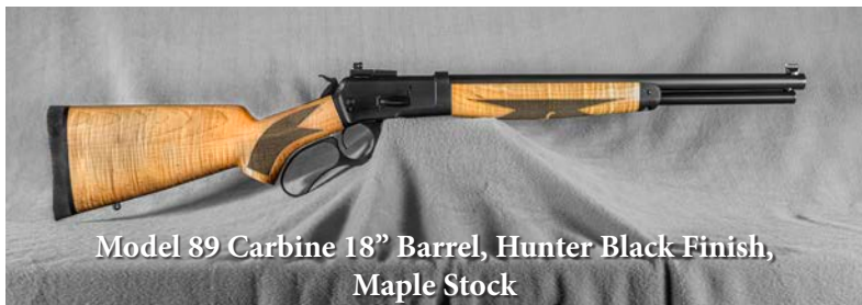
Model 89 Carbine 18" Barrel, Hunter Black Finish, Maple Stock