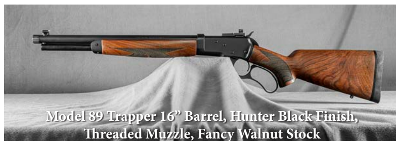
Model 89 Trapper 16" Barrel, Hunter Black Finish, Threaded Muzzle, Fancy Walnut Stock