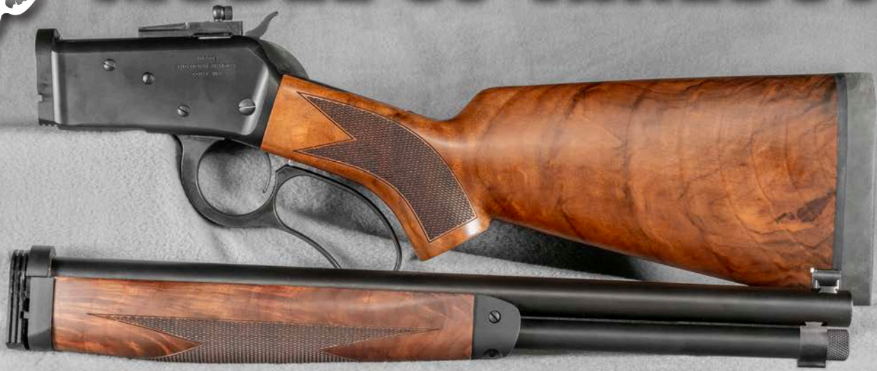
Model 89 Takedown rifle, 18" Barrel, Standard Walnut Stock, rear Skinner Sight, front white pearl bead Marble sight.

Proudly built in the USA , the Big Horn Armory lever action rifles continue the rich legacy of American firearms design and development. Designed and built from the ground up and solidly engineered using the finest materials, techniques and CNC technology, Big Horn Armory's lever action rifles embody the best of the Models 1886 & 1892 lever actions in a modern platform capable of handling the powerful 500 S&W Magnum and other big bore magnum cartridges while delivering 300-600 fps more than the revolver.