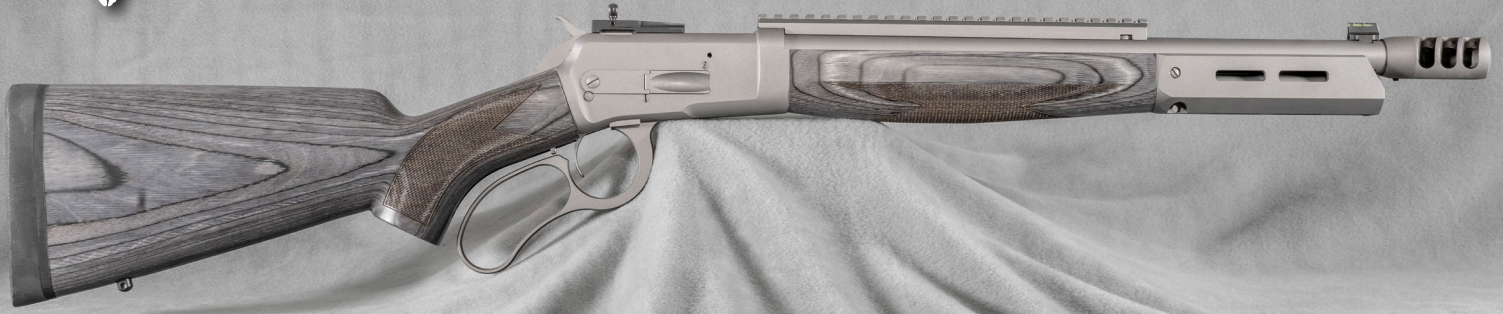
Model 89 White Lightning, 16" Threaded Barrel, M-Lok Fore End Tip, Scout Scope Mount, Muzzle Brake, Grey Laminate Stock.

Proudly built in the USA, the Big Horn Armory lever action rifles continue the rich legacy of American firearms design and development. Designed and built from the ground up and solidly engineered using the finest materials, techniques and CNC technology, Big Horn Armory lever action rifles embody the best of the Models 1886 & 1892 lever actions in a modern platform capable of handling the powerful 500 S&W Magnum, and other big bore magnum cartridges while delivering 300-600 fps more than the revolver.